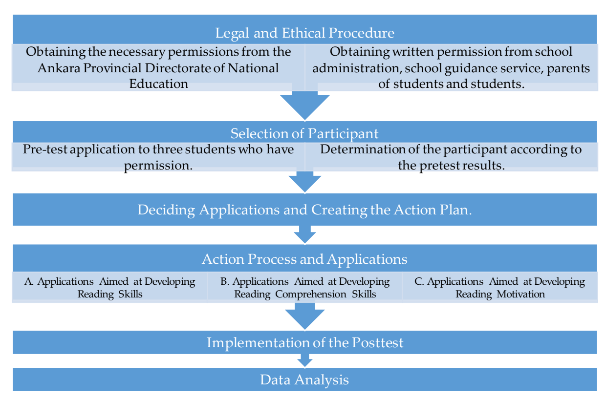
Figure 1. Research Process

In this study, which aims to develop the reading, reading comprehension and motivation of a second grade elementary school student, first of all, a pretest was applied in order to determine the student's current status. Next, by conducting a review of the literature, the methods and techniques to be used for eliminating deficiencies in the student were determined, and an action plan was prepared. In line with this plan, an implementation lasting 30 lesson periods over 8 weeks was made, and the process was completed by applying a posttest. The flowchart showing the steps followed during the research process is presented in Figure 1.