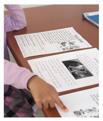
Figure 8. Photograph taken during text selection

Applications Aimed at Developing Reading Motivation: For developing reading motivation, interesting texts and strategies of rewarding and praising were utilised. Accordingly, Ayşe was shown three different texts, she was asked to look at the title and visuals, and then she was requested to choose the text she wished to read. Moreover, the names of the main characters in some texts were exchanged with the name of the participant by the researcher, thereby attempting to enable Ayşe to associate the text to herself.