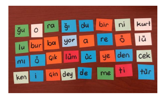
Figure 3. A short section of a syllable list.