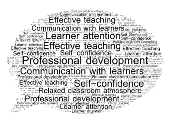
Figure 1. The Importance of Immediacy Behaviours

As well as those conceptualizations, the trainees gave important clues on why they found teacher immediacy crucial. Figure 1 shows the areas which are closely related to teacher immediacy in the minds of the trainees: